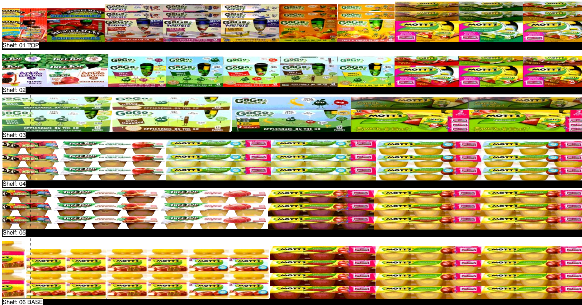
Shelf: 01 TOP

CLASS 4/5 STORES - NORTHWEST/MIDWEST/SOUTHWEST MARKETING AREAS