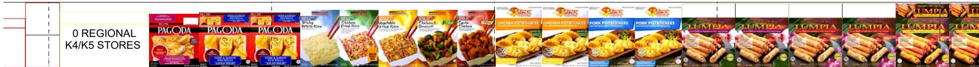
Shelf: 1 TOP