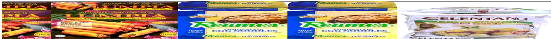
Shelf: 1 TOP