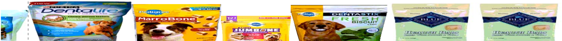
Shelf: 6 BASE